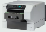
The RICOH Ri 100 is highly compact, portable, and easy to use